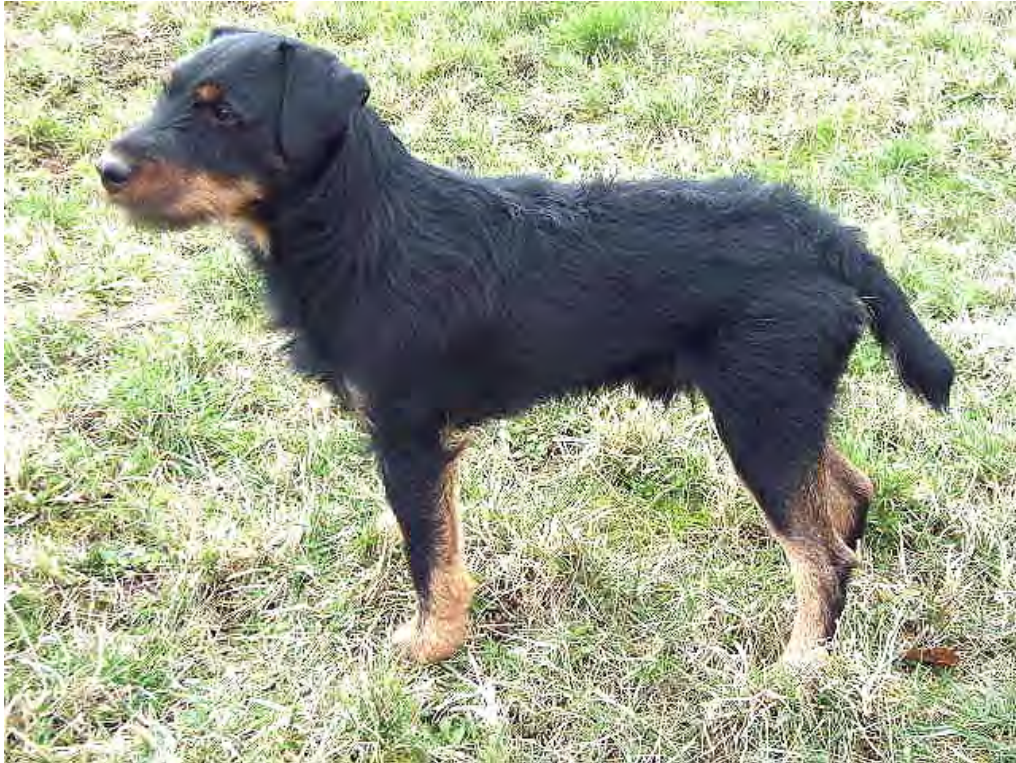
Hunting Terrier ( Deutscher Jagdterrier )