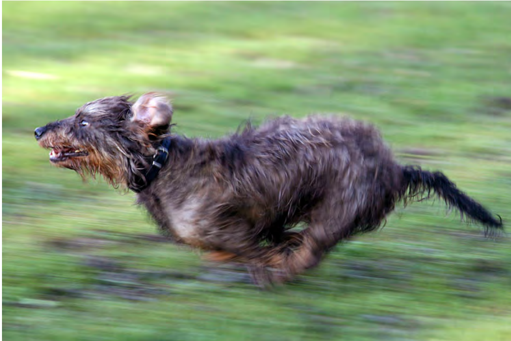
Rough Haired Dachshund ( Rauhaardackel )