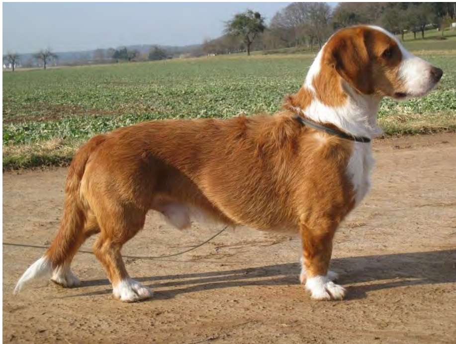
Westphalian Dachsbracke ( Westphälische Dachsbracke )