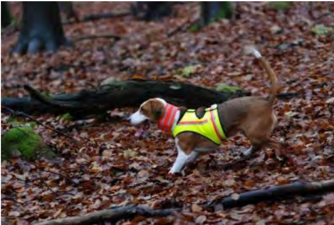
Deutsche Bracke ( Deutsche Bracke )