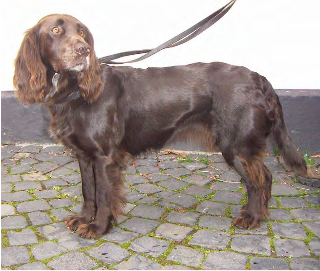
German Springer Spaniel ( Deutscher Wachtelhund )