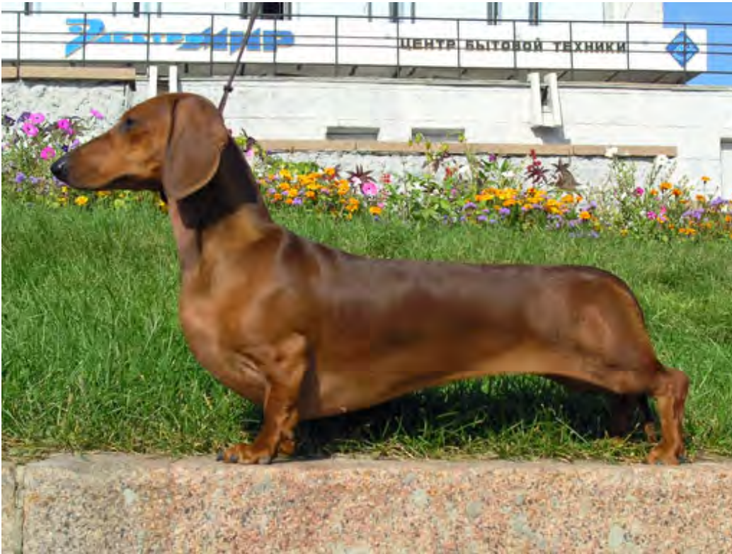
Short Haired Dachshund ( Kurzhaardackel )