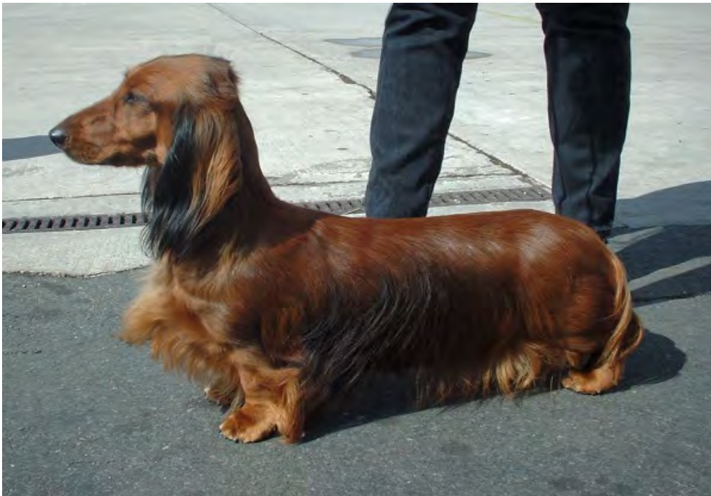
Long Haired Dachshund ( Langhaardackel )