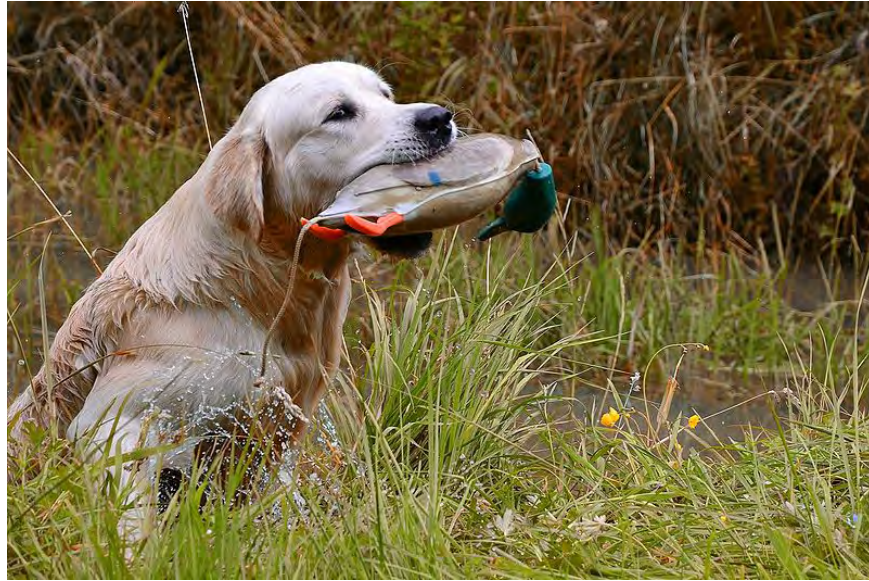
Golden Retriever ( Golden Retriever )

The Golden Retriever combines outstanding physical appearance with many qualities that make it a favorite among hunters for waterfowl and upland-game.