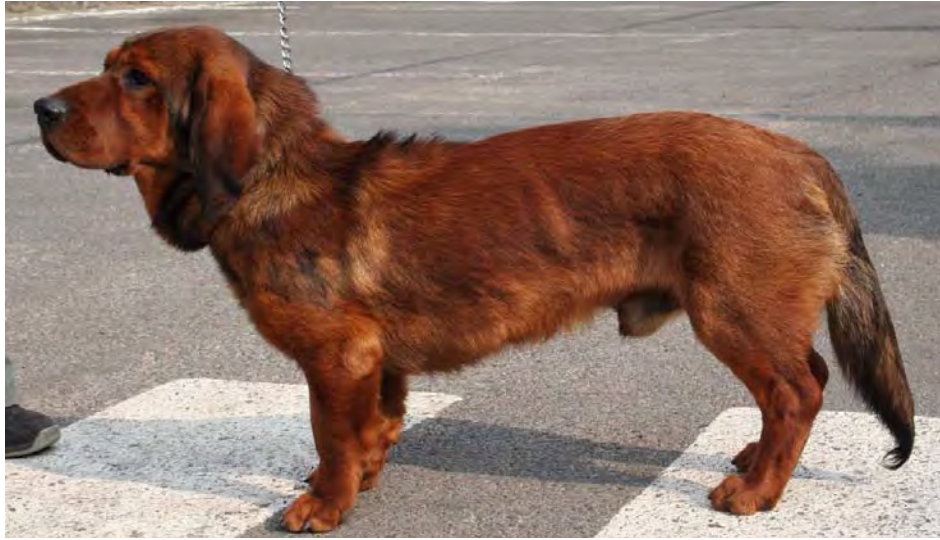
Alpine Dachsbracke ( Alpenländische Dachsbracke )

Hounds are the oldest species of hunting dogs. They are used in packs to hunt for hare and fox and are usually kept in kennels.