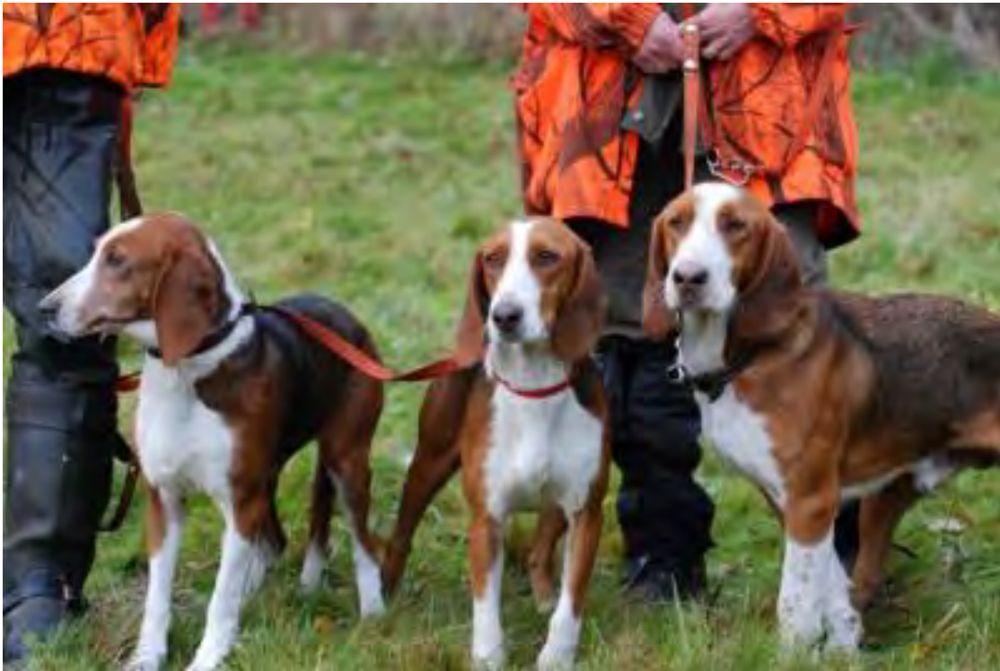
Deutsche Bracke ( Deutsche Bracke )