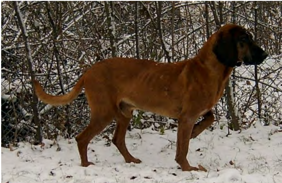
Bavarian Mountain Bloodhound ( Bayerischer Gebirgsschweißhund )

Bloodhounds are trained to follow the blood trail of a wounded animal. They are sturdy dogs and built for endurance. This group includes such dogs as the Bayerischer Gebirgsschweißhund and the Hannoverscher Schweißhund .