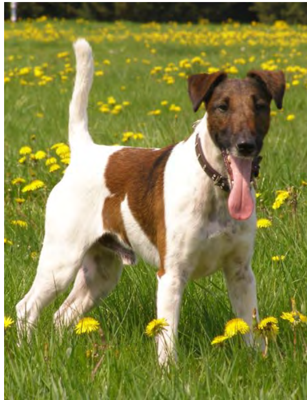
Fox Terrier ( Glatthaar Foxterrier )