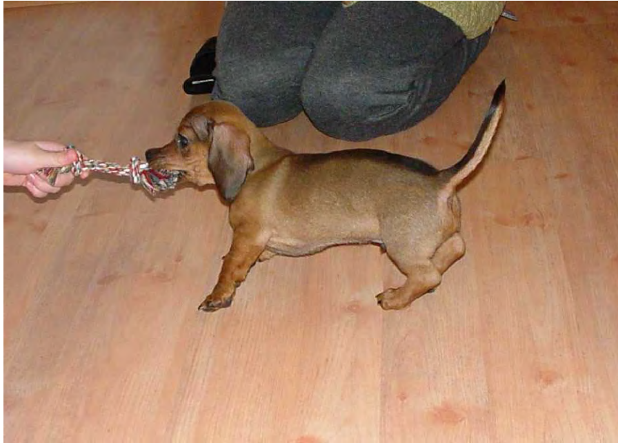
Miniature Dachshund (Zwergdackel)