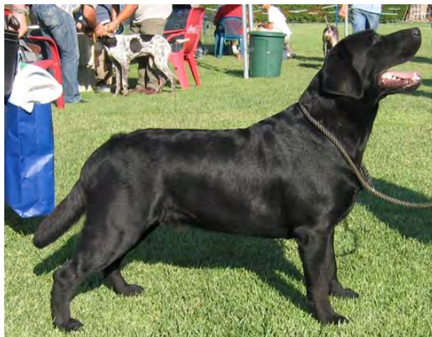
Labrador Retriever ( Labrador Retriever )