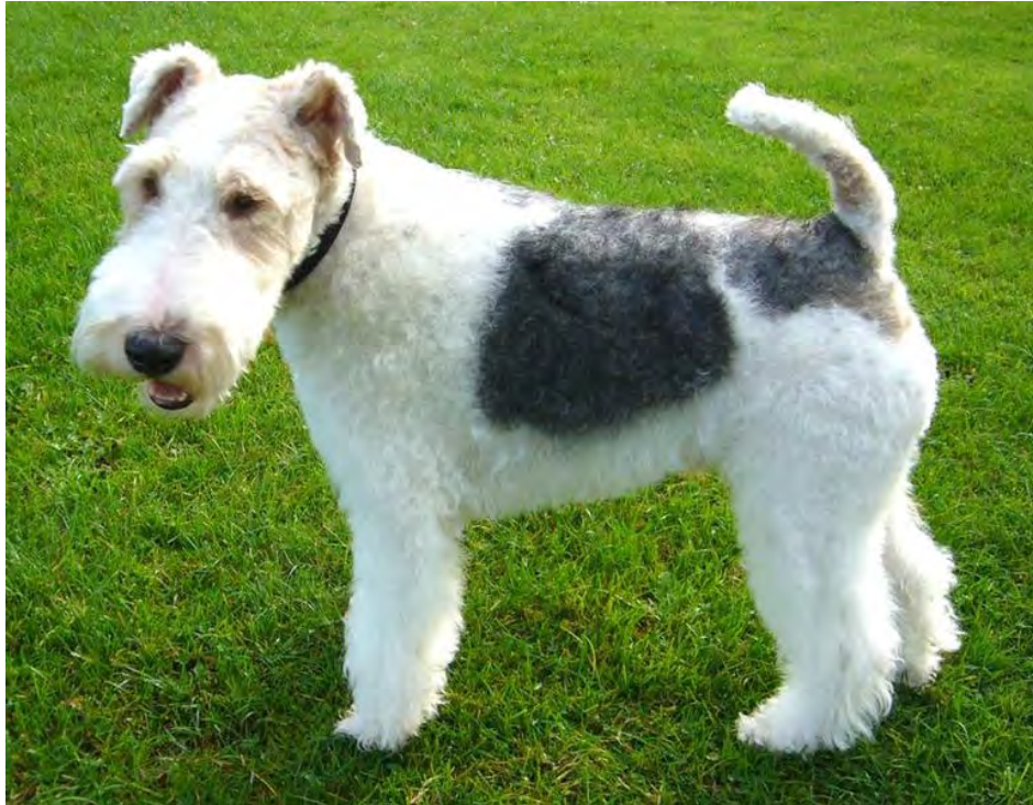
Fox Terrier ( Drahthaar Foxterrier )