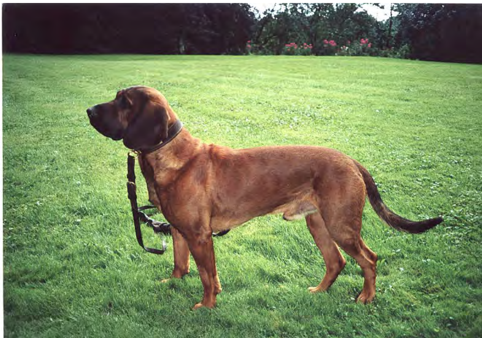
Hanover Bloodhound ( Hannoverscher Schweißhund )