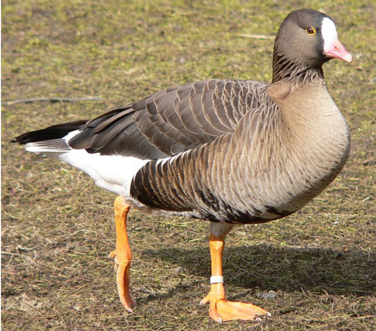
Lesser White-fronted Goose ( Zwerggans )

The length of the Lesser White-Fronted Goose ( Zwerggans ) is 26 inches.