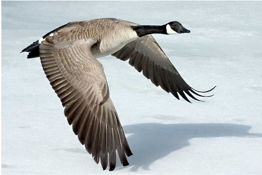
Canada Goose ( Kanadagans )