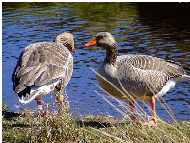
Greylag Geese Pair ( Graugans Paar )