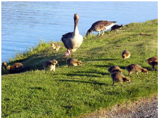
Greylag Geese Family ( Graugansfamilien )

The average Greylag Goose ( Graugans ) weighs 8 to 9 pounds. It is about 32 to 35 inches long with a wingspan of 64 inches. The Graylag Goose's overall color is gray, the bill is orange with a white tip, and the feet are pink, and the under parts are whitish. The call of the wild goose resembles the call of the domestic goose.