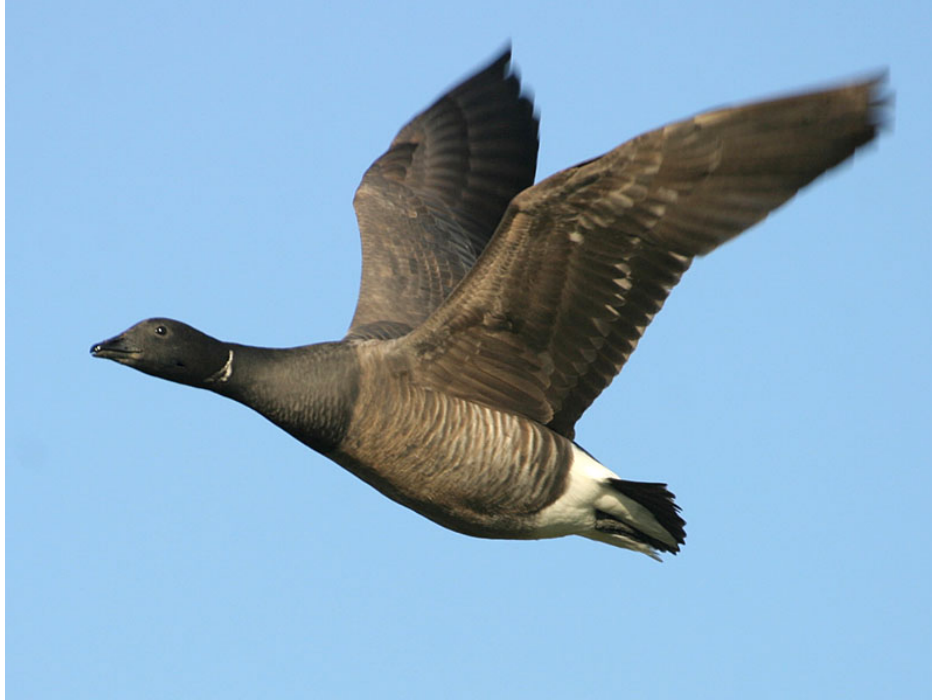
Brent Goose ( Ringelgans )