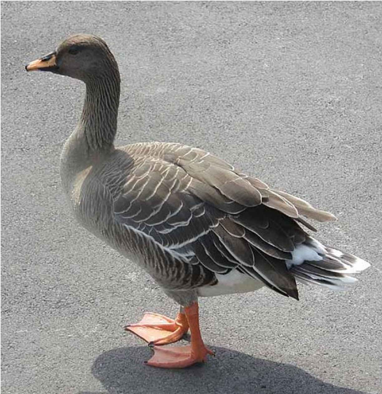
Bean Goose ( Saatgans )

The Bean Goose ( Saatgans ) is about 3 inches smaller than the Greylag goose. The German name for the Bean Goose comes from its diet of seeds and seedlings ( Saat ). The Bean Goose often feeds in grain fields. The bill is black with reddish-orange, its feet are yellow, and its overall color is darker than that of the Greylag Goose.