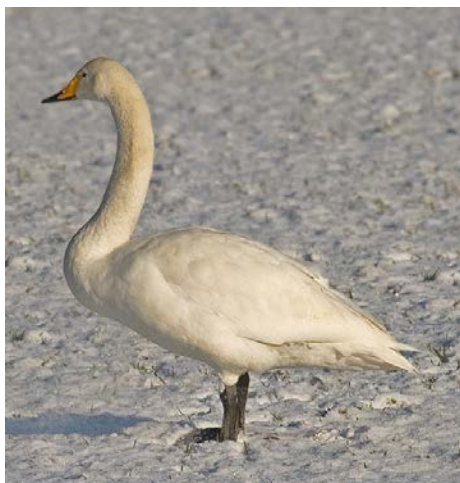
Whooper Swan ( Singschwan )