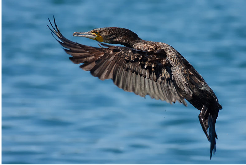
Great Cormorant ( Kormoran )