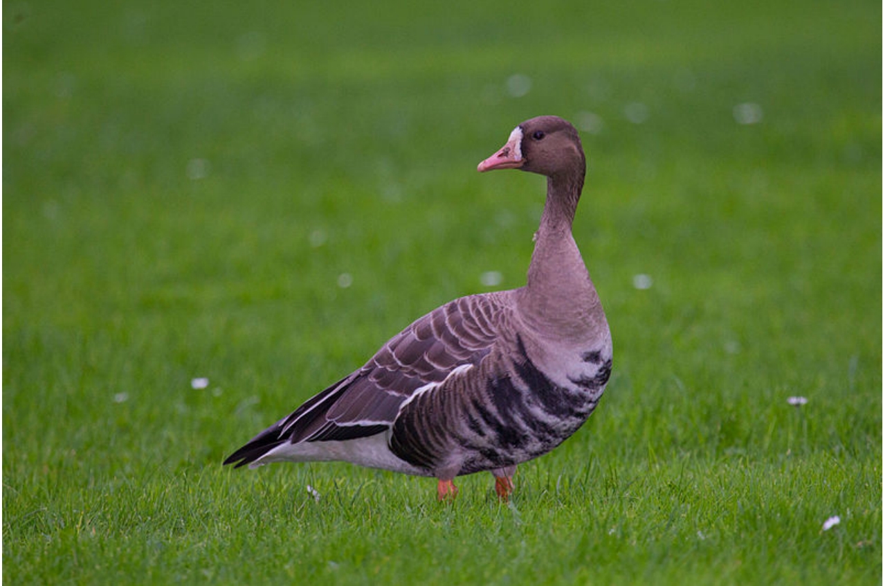
Greater White-fronted Goose ( Blässgans )

The name for the White-Fronted Goose ( Blässgans ) comes from the white spot above the bill.