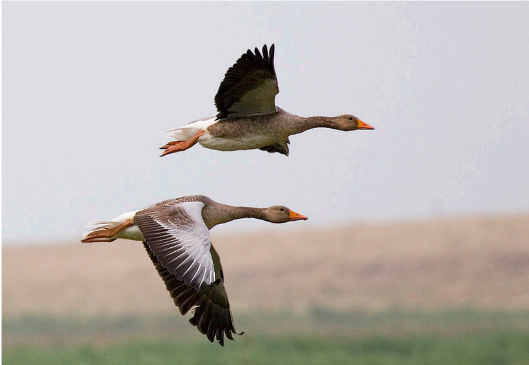
Greylag Geese in flight ( Graugänse im Flug )