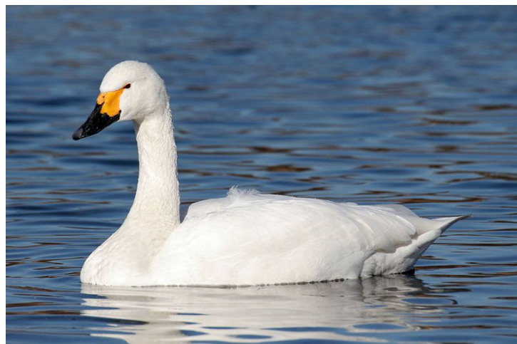
Tundra Swan ( Zwergschwan )