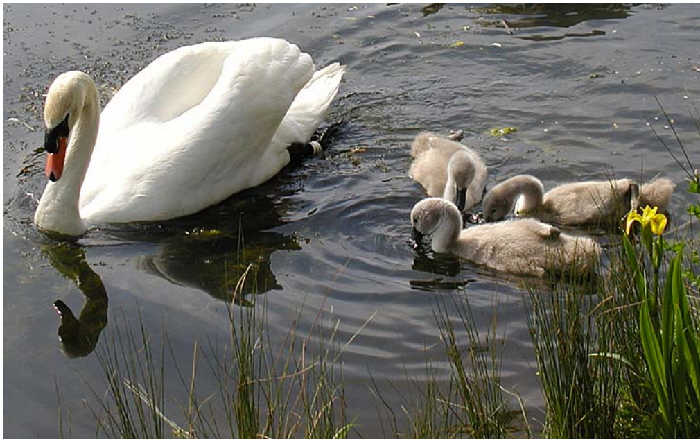
Mute Swan ( Höckerschwan )

Only the Mute Swan ( Höckerschwan ) is open for hunting, from 1 September until 15 January.