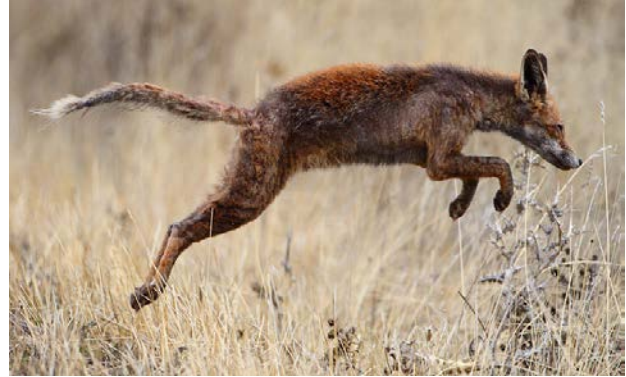
Diseased (Mange) Red fox

During the 1980s, intensive immunization against Rabies was carried out in the form of treated bait. This led to an explosion in the Fox population and a dramatic decrease in other small game. Pheasants were one of the hardest hit species with Rabbit and Hare close behind.