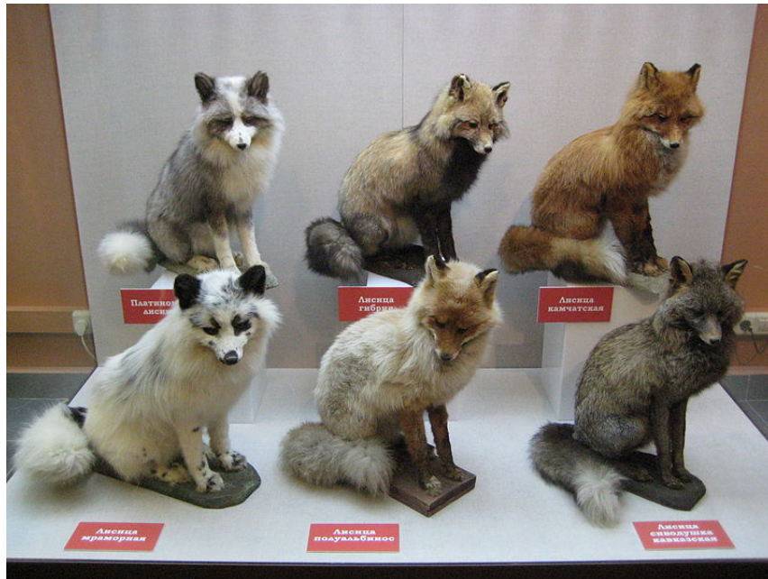
Various Red fox color mutations

Normal Red Fox coloration is not the only pattern found in this animal. The “Birkfuchs” has a yellow-red back, white throat and a very large tail. There is also a “Kreuzfuchs” which carries a dark spine stripe crossed by a shoulder stripe, hence the name.