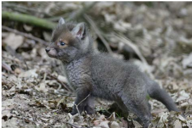
Red fox kit ( Rotfuchskitz )