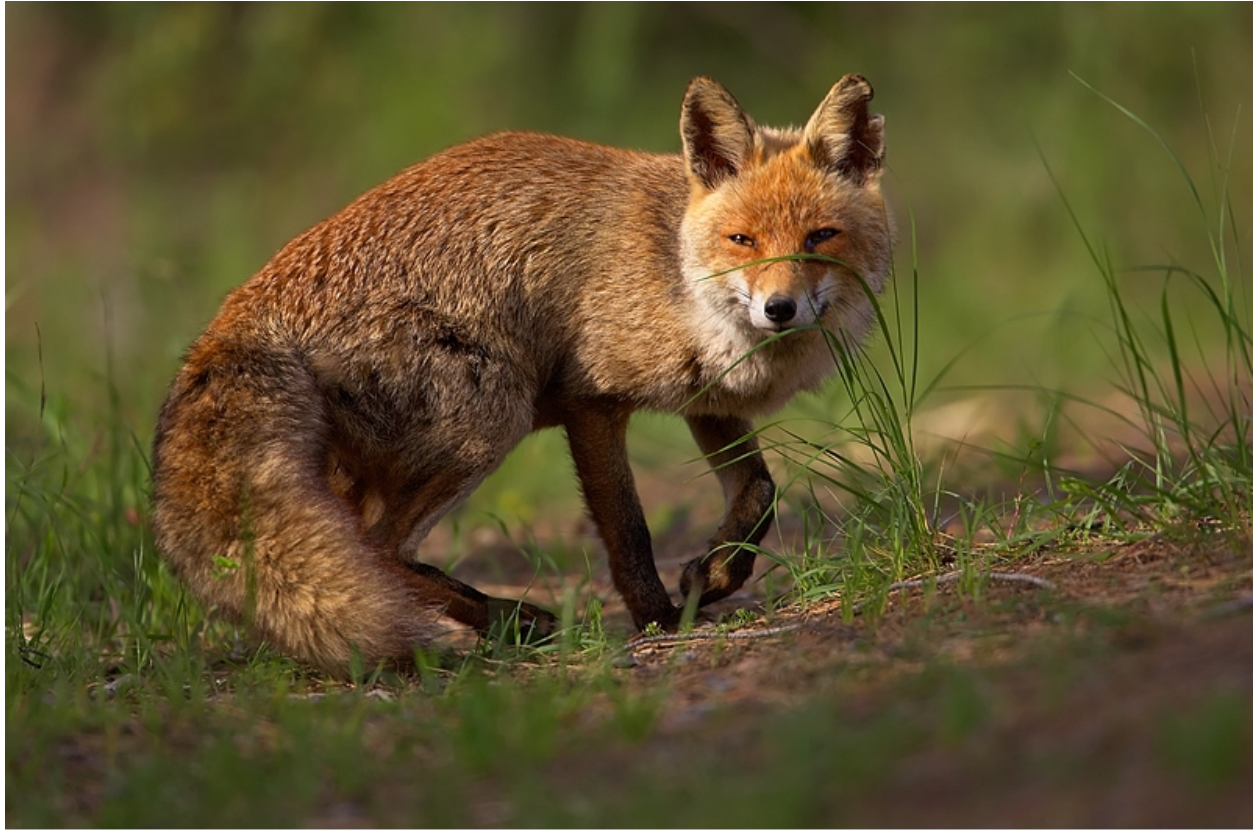
Red fox ( Rotfuchs )