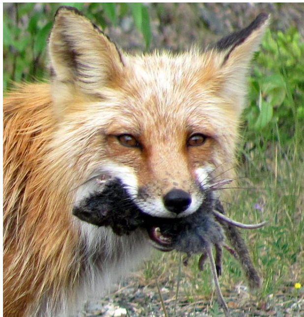
Red fox with rodent prey

As one of the mandatory duties placed by law ( Bundesjagdgesetz ) on hunters for the protection of all game, Fox numbers must be reduced where problems occur.