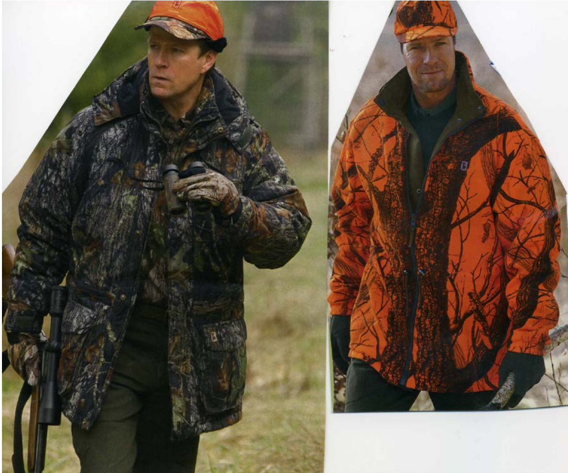
Modern camouflage and warning color