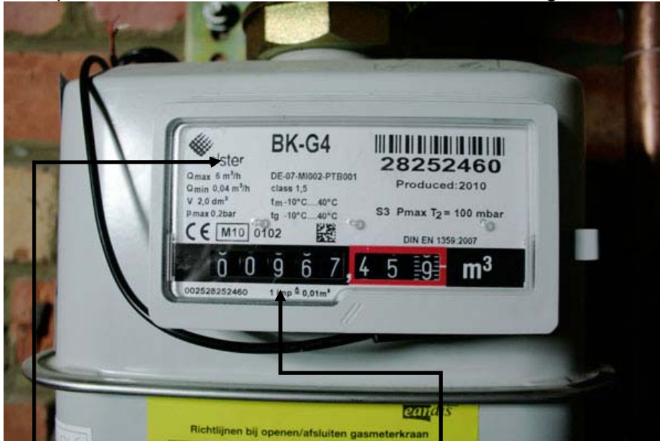
Meter Serial Number

Example of Gas meter: Meter Number: 28252460 reading 967.4m 3